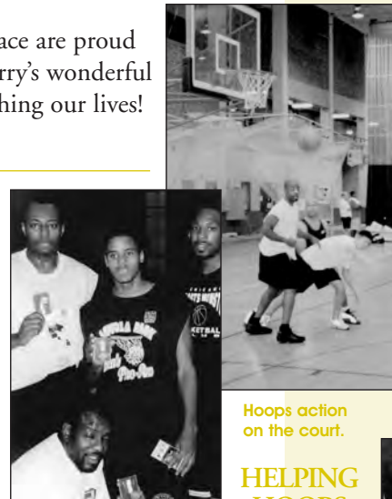
Hoops action on the court.

enjoy getting out there for kicks, while others have serious talent to display. Everyone gets to enjoy the fun in a great atmosphere.