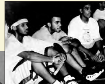
Team members take a break.