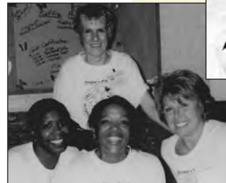
Volunteers are all smiles!