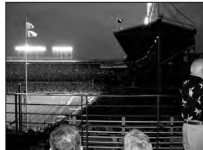
Friends of Goldie's and the Cubs enjoy the view from the 3rd floor balcony

This year's Goldie's Place Cubs Summer Celebration was the Fourth Annual and by far the best ever. The two-part event was kicked off with a dinner and silent auction at the Black Rock Tavern near Wrigley Field on north Damen Avenue. Attendees enjoyed tasty appetizers, a delicious buffet meal, and open bar in a warm and friendly firelit atmosphere.