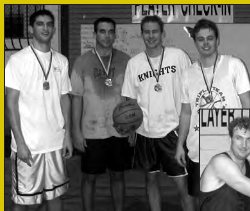
Hoops 2003 Championship Team

As members of the Chicago Continuum of Care, we are fully enlisted in the 10-Year Plan to End Homelessness that was endorsed by Mayor Richard M. Daley last year. If you have been looking for a way to be part of the solution, Goldie's Place needs you!