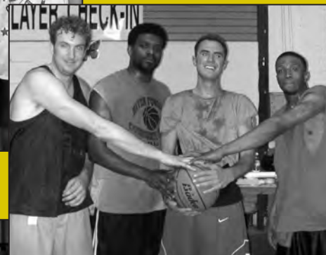
Hoops 2003 Second Place Team