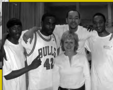
The Murphy Maintenance Team